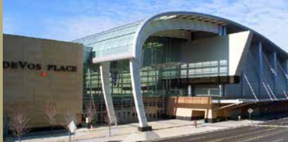
Acton's 27th Annual Dinner will take place at the DeVos Place.