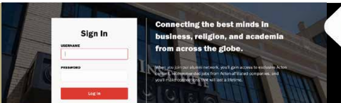
The Acton Alumni Association web portal hosts a significant amount of new content.

If you haven't had an opportunity to view the Acton Alumni Association web portal, please take some time and visit alumni.acton.org .