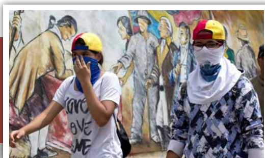
Mérida, Venezuela - October 2016

from Venezuela's misfortune than to work toward a solution.