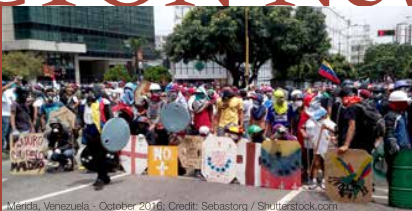
Mérida, Venezuela - October 2016; Credit: Sebastorg / Shutterstock.com Protesters march against the Venezuelan government.